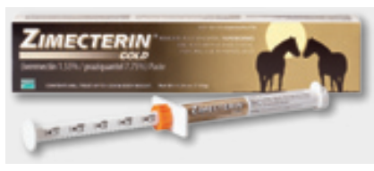
Offer valid on purchases made February 1, 2008, through June 30, 2008.

Save $0.50 per syringe on ZIMECTERIN ® Gold (ivermectin/praziquantel), minimum order of three syringes required. Also save on your purchases of Merial ® Brand Cattle Products, including IVOMECS ® EPRINEX ® (eprinomectin), IVOMECS Plus (ivermectin/clorsulon), IVOMECS (ivermectin) 1% Injection, IVOMECS Pour-On and IVOMECS Sheep Drench, please see the rebate details below.